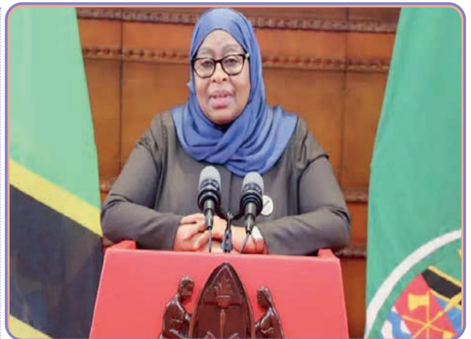
President Samia Suluhu Hassan

“Poorly performing contractors should not be given another chance at all,” she said and directed Tarura to prepare and